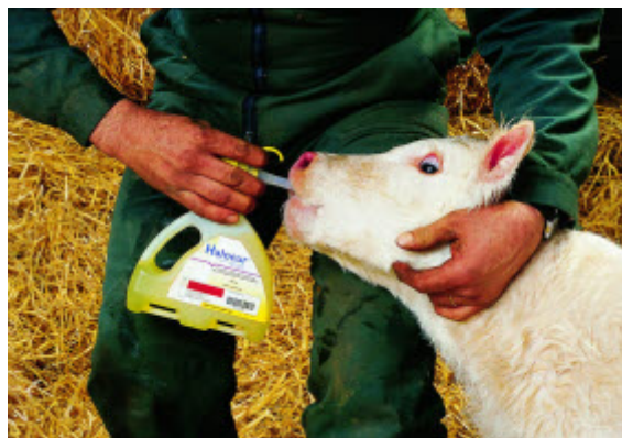
Halocur – a specific treatment for cryptosporidia

Scour is a perennial problem but here's a few reminders re prevention and treatment.