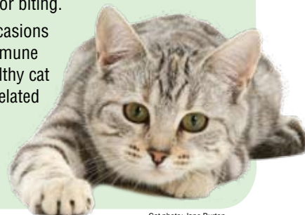
Cat photo: Jane Burton

The good news is that there is a very effective vaccine, giving cats protection against this deadly disease. Please contact us for further information or an appointment.